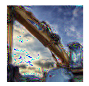
(a) middle : PSNR \approx 26dB , right: PSNR \approx 20dB