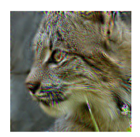
(b) middle : PSNR \approx 23dB , right: PSNR \approx 19dB